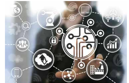
Semiconductor supply chains have to respond to the needs of an increasingly dynamic market.

In addition, these companies must be prepared for highly volatile and cyclical demand, including shifts in customer segments. As a consequence, in recent years there has been a significant increase in M&A activities as organizations seek to secure the latest technologies, expand capacity, and gain access to attractive market segments.