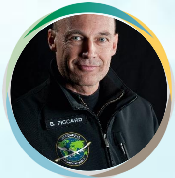
BERTRAND PICCARD Founder and President Solar Impulse Foundation