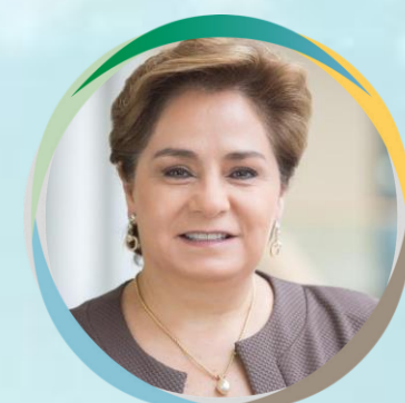
PATRICIA ESPINOSA Former Executive Secretary of the United Nations Framework Convention on Climate Change (UNFCCC) and Founder and CEO OnePoint5