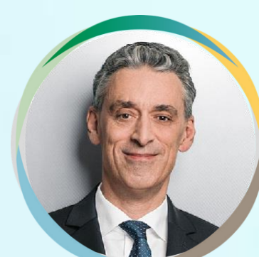
FRANK APPEL CEO Deutsche Post DHL Group