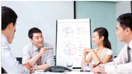
Supply Chain Planning

By understanding and anticipating your business and logistics needs in an ever-changing environment, our dedicated teams of supply chain consultants provide a reliable source of expertise. We provide you with advisory and/or consulting services, for example, an in-depth analysis of all network flows and supply chain processes across your organization in order to re-engineer and develop an optimized supply chain.