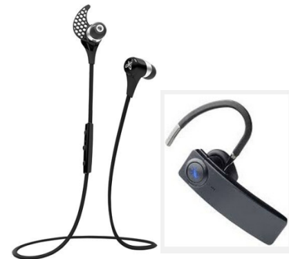
Bluetooth Headphones / Headsets