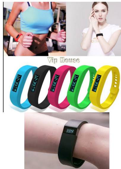
Sports or Health monitoring bands