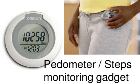
Pedometer / Steps monitoring gadget