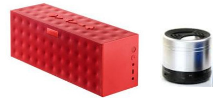
Small/Portable bluetooth speaker