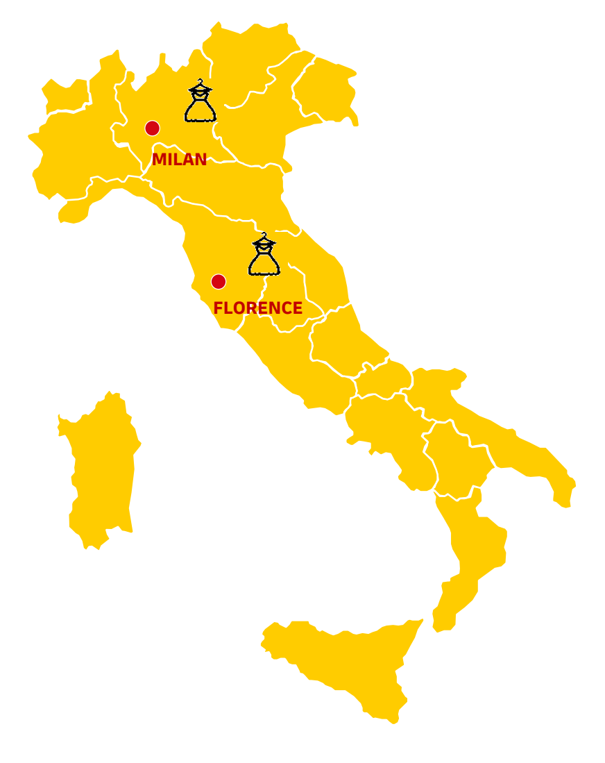
• Fashion & Luxury Competence Centers