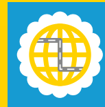
Network, Product and Carrier Management