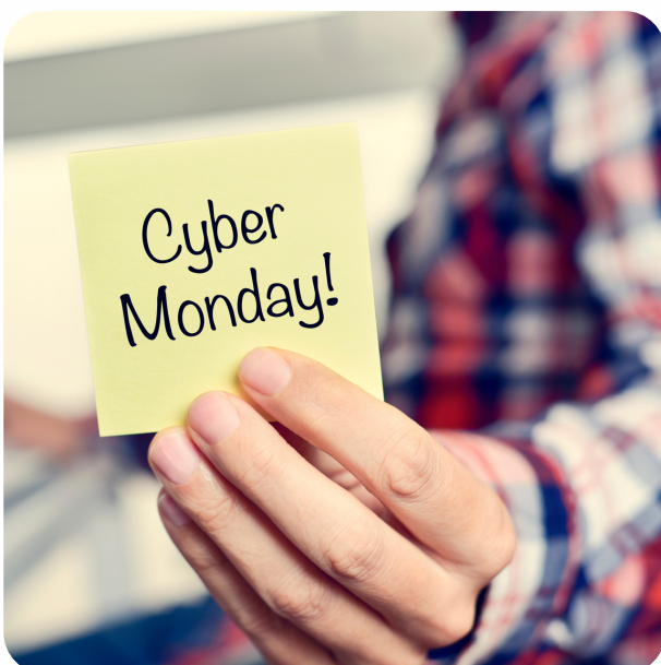
Cyber Monday November 28