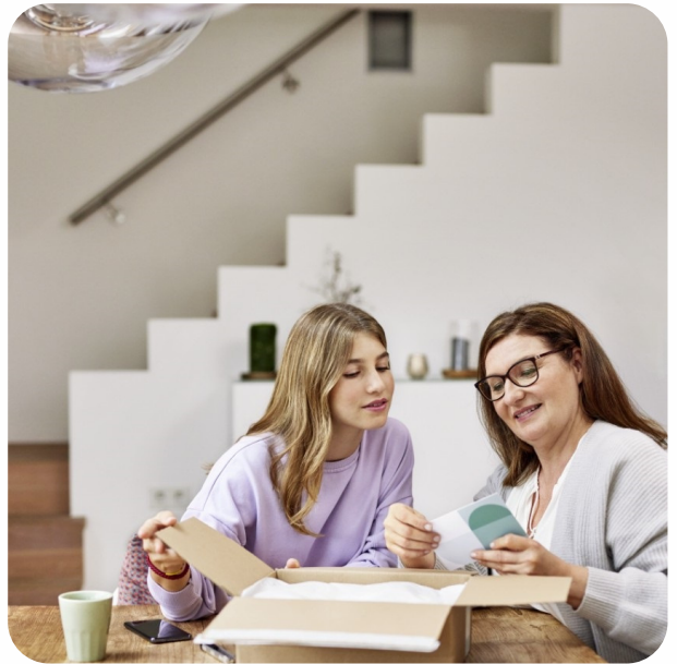
Mother's Day May 8