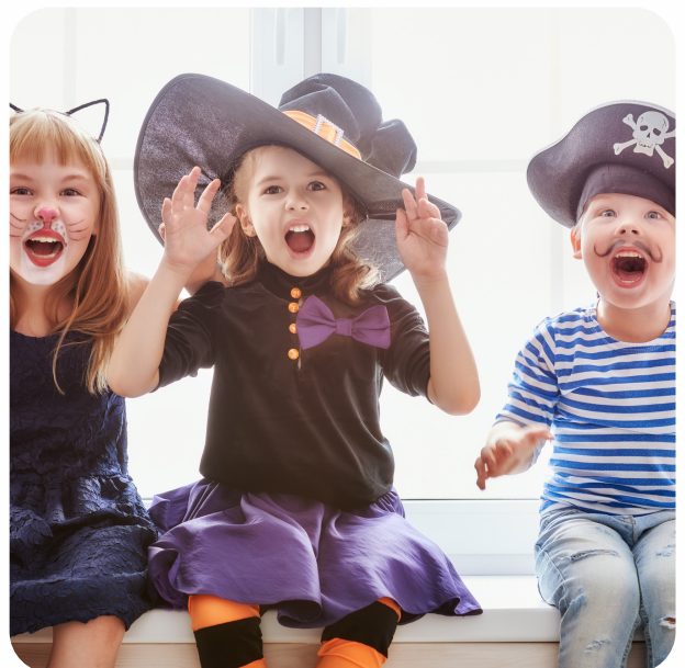
Halloween October 31