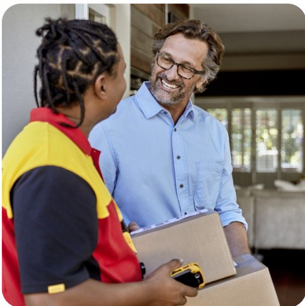
Father's Day June 19