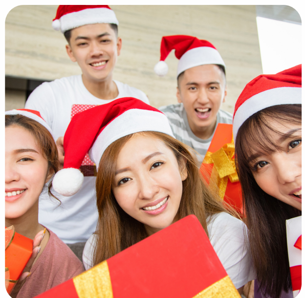
Christmas Day December 25