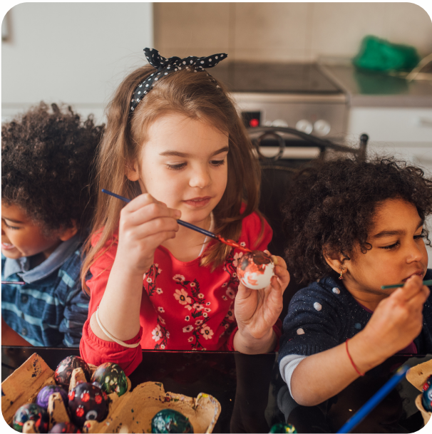
Easter April 17