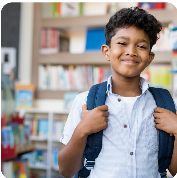
Back to School August-September