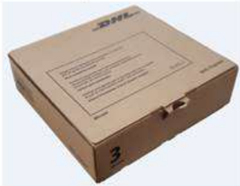
Brown Box 3

FEATURES: Paper cardboard box, brown color with black DHL logo MEASUREMENT: Length: 337mm Width: 182mm Height: 100mm MAX RECOMMENDED WEIGHT: 1KG