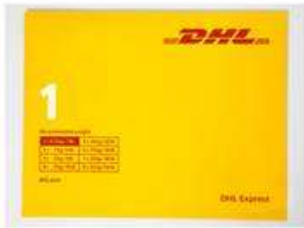
Express Easy Envelope

FEATURES: A4 size paper cardboard, yellow color with red DHL logo. MEASUREMENT: Length Unsealed: 350mm Length Seal: 275mm Width: 10mm MAX RECOMMENDED WEIGHT: 0.5KG