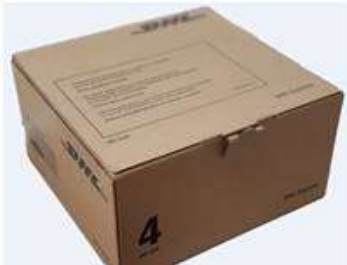
Brown Box 4

FEATURES: Paper cardboard box, brown color with black DHL logo MEASUREMENT: Length: 337mm Width: 322mm Height: 100mm MAX RECOMMENDED WEIGHT: 2KG