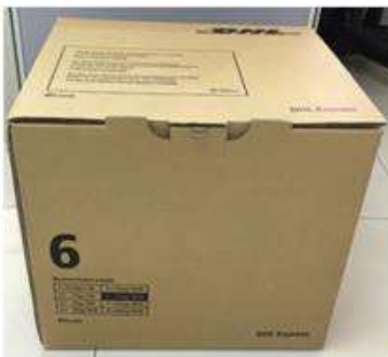
Brown Box 6

FEATURES: Paper cardboard box, brown color with black DHL logo MEASUREMENT: Length: 337mm Width: 322mm Height: 345mm MAX RECOMMENDED WEIGHT: 10KG