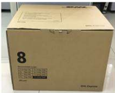
Brown Box 8

MEASUREMENT: Length: 481mm Width: 404mm Height: 389mm MAX RECOMMENDED WEIGHT: 20KG