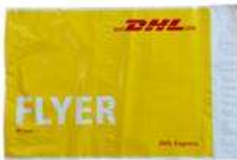
Express Flyers Standard

FEATURES: A4 size paper cardboard, yellow color with red DHL logo. MEASUREMENT: Length Unsealed: 350mm Length Seal: 275mm Width: 10mm MAX RECOMMENDED WEIGHT: 0.5KG