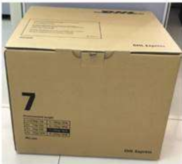
Brown Box 7

FEATURES: Paper cardboard box, brown color with black DHL logo