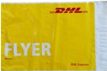
Express Flyers Large

FEATURES: Big plastic flyer, pantone red, DHL Logo and white print on pantone yellow. MEASUREMENT: Length: 410mm Width: 310mm MAX RECOMMENDED WEIGHT: 2KG