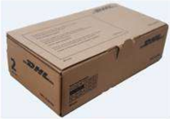
Brown Box 2

FEATURES: Paper cardboard box, brown color with black DHL logo MEASUREMENT: Length: 337mm Width: 182mm Height: 100mm MAX RECOMMENDED WEIGHT: 1KG