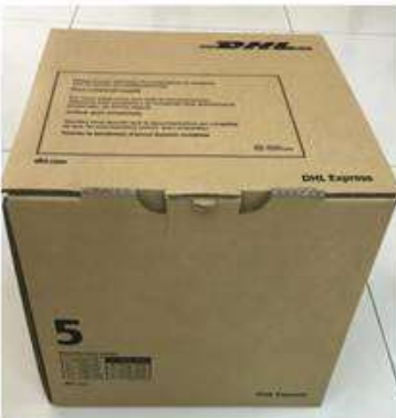
Brown Box 5 JUMBO JUNIOR

FEATURES: Paper cardboard box, brown color with black DHL logo MEASUREMENT: Length: 337mm Width: 322mm Height: 180mm MAX RECOMMENDED WEIGHT: 5KG